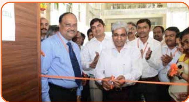
Honorable Chancellor inaugurating Alumni Cell

REVA Alumni Association is dedicated to bring together the alumni community on a common platform to build an appropriate channel of personal and professional support to all through 'self-help' within the community.